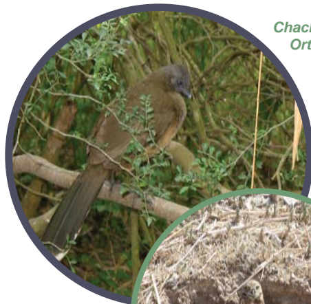
Chachalaca Ortalis vetula

I n addition to supplying El Paso with drinking water, the Rio Grande is home to a variety of wildlife. These species depend on clean water from the Rio Grande to survive.