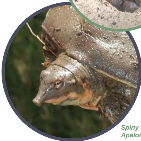
Spiny Softshell Turtle Apalone spinifera