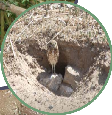
Burrowing Owl Athene cucularia