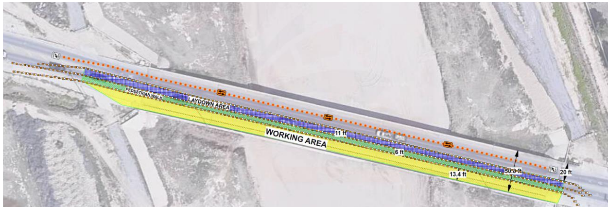
Phase 1: All Traffic Shifted North

through February 24, 2024, while work is completed on the north side. The maps below illustrate the traffic changes during each phase.