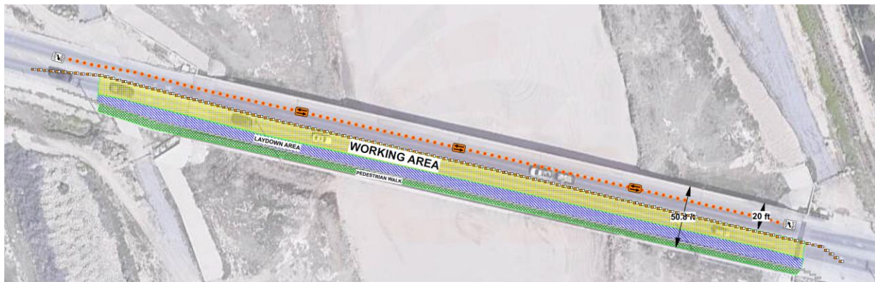
Phase 2: Vehicular Traffic Remains at North and Pedestrian Access Shifted South