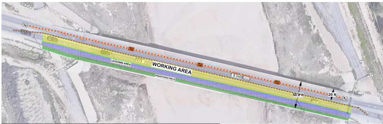
Phase 2: Current Temporary Traffic Lanes at North