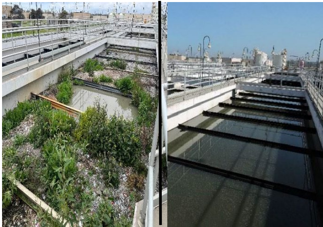
Before and after: Sediment and debris accumulation in a primary sedimentation tank resulting in reduced capacity and compliance issues.

IBWC is working on 4 key fronts to address transboundary flows and wastewater quality affecting the coast.